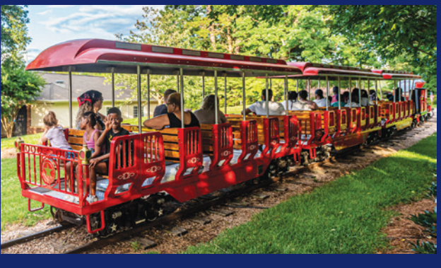
Tickets are $1.50 per person per attraction.

From August 12 – October 20, the train and carousel will operate on weekends only: Saturday (10 a.m. – 7 p.m.) and Sunday (noon – 6 p.m.). They will also be open Labor Day, Monday, September 2, from noon – 6 p.m. Tickets are $1.50 per person per attraction.