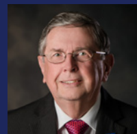
Mayor Darrell Hinnant

The City's location is easily accessible by plane (two international and two regional airports), train (station is downtown), highways, and ports. It's easy to see why businesses are finding success here and why our City is such an attractive destination for commerce and community alike.